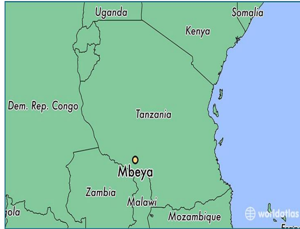
Fig. 2 Location of Mbeya city in Mbeya region (Worldatlas 2019)