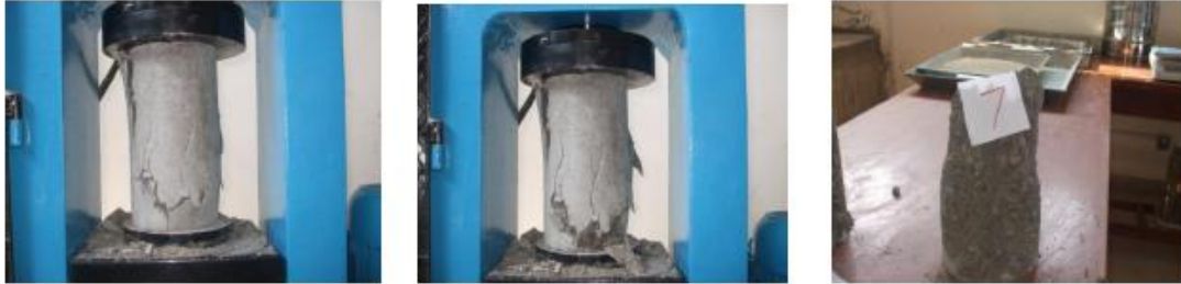
Fig. 5 Details of cracked sections and cracking pattern of natural aggregates concrete

2. The water requirements of the recycled bricks aggregates when blended with the recycled concrete aggregates and natural aggregates, has been increased. The reduction in the bricks contents has led to reduction in the water requirements or increase in the slump.