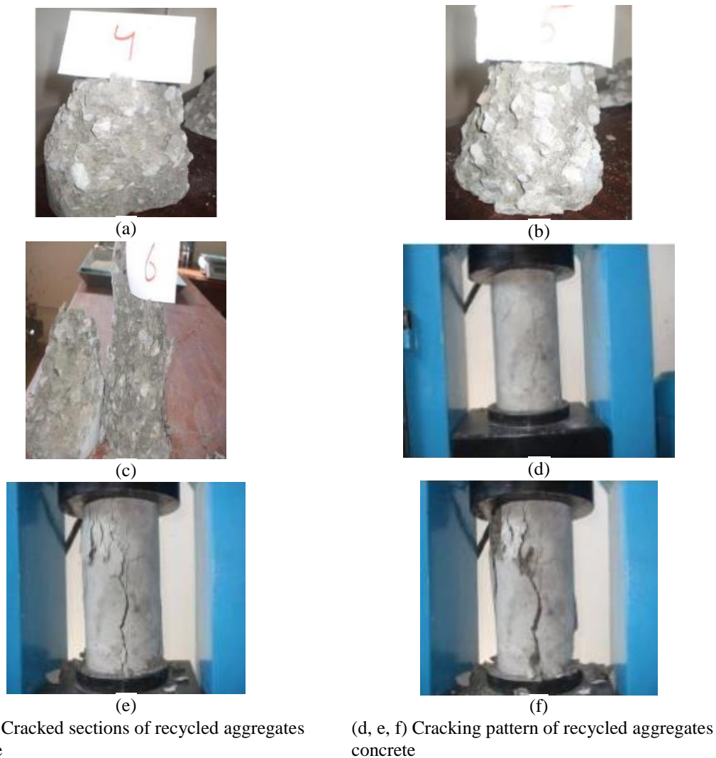
Fig. 4 Details of cracked sections and cracking pattern of recycled aggregates concrete

failure of brick recycled aggregates. The natural and recycled aggregates are mainly uncrushed. The details of NBR-1 are shown in Fig. 3.