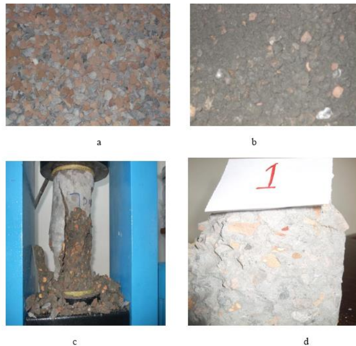
(a) Dry mix of aggregates of natural, recycled concrete and bricks (NBR-1)