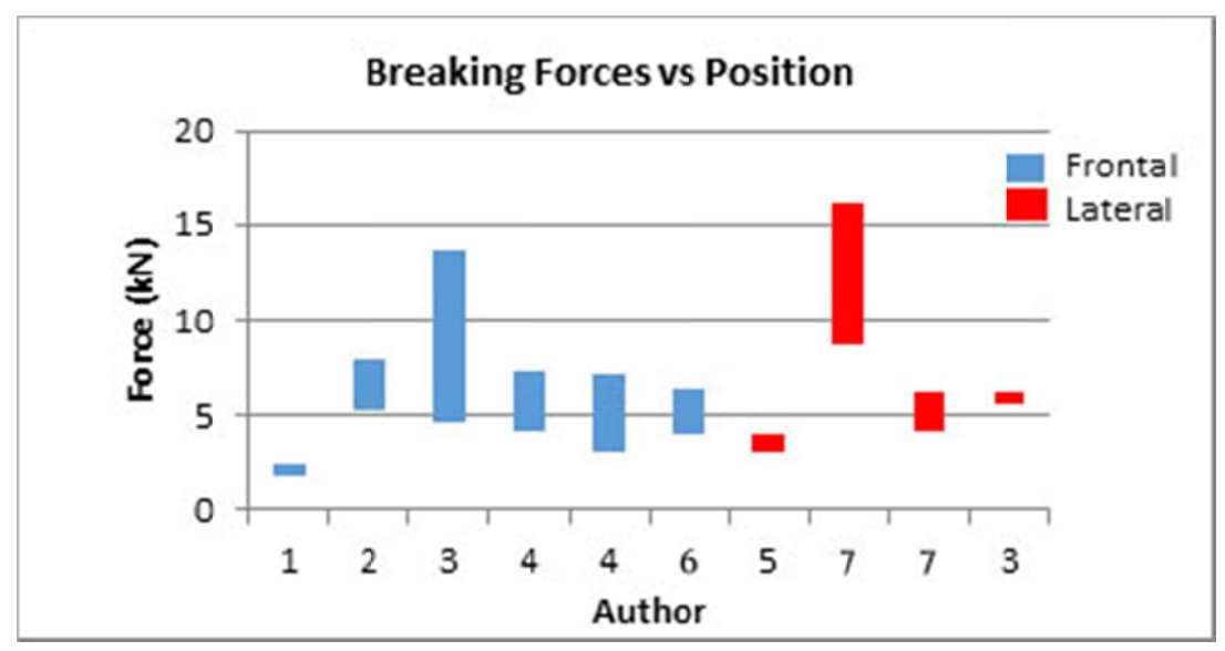
Fig. 1 Chart of selected bone failure values based on position and study 1) Cormier et al. (2011b), 2) Swearingen (1965), 3) Yoganandan et al. (1991), Yoganandan et al. (1995), Yoganandan and Pintar (2004), 4) Hodgson (1967), Hodgson et al. (1970), Hodgson et al. (1983), 5) Nahum et al. (1968), 6) Schneider and Nahum (1972), 7) Allsop et al. (1992)

cylinder with velocities of 4.3 m/s and 2.7 m/s respectively. The mean fracture forces were 12390 and 5195 N respectively (Allsop et al. 1992).