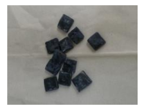
Fig. 1 Study specimens

After specimen preparation and finishing, they were dry air-cleaned and submerged in 5 ml distilled water, Fig. 2. Each specimen was transferred into a new vial of 5 ml distilled water every 24 hours for 4 days. The extracted solutions were analyzed by Visible Light Spectroscopy, Fig. 3. The wavelength was set to 500 nm and the absorbance values were recorded for each solution.