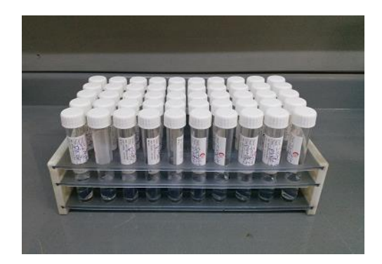
Fig. 2 Study samples