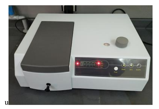
Fig. 3 Visible Light Spectroscopy