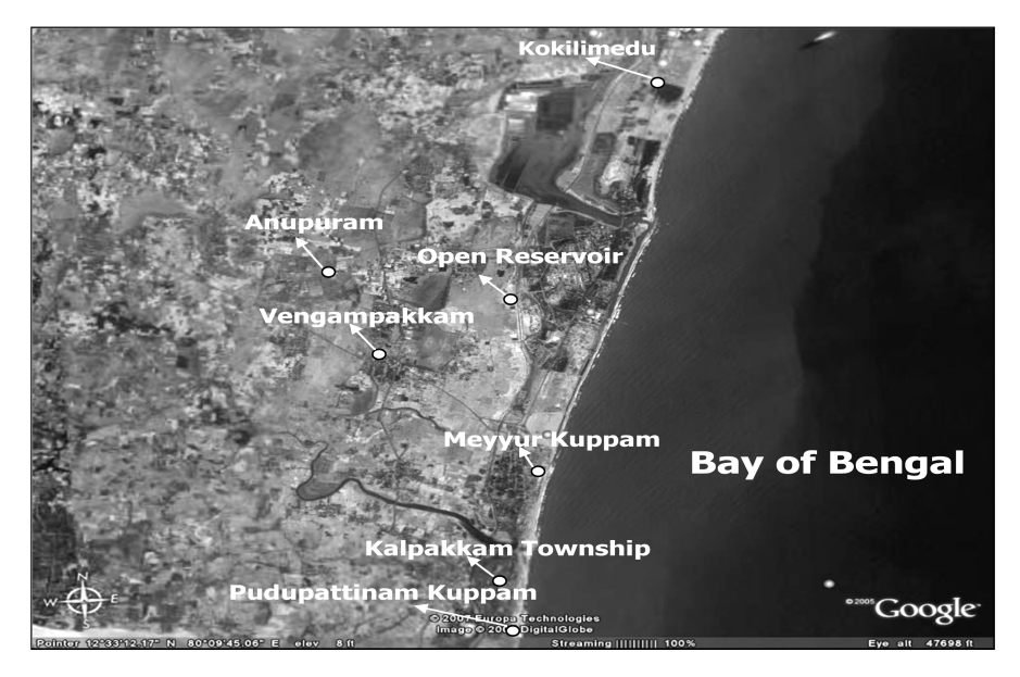
Fig. 1 Map of the study area showing sampling stations