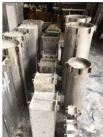
Fig. 6 Stainless steel slenderness tests, (Kazemzadeh Azad, Li and Uy, 2019)

Stainless steels can be mainly categorized into austenitic and duplex types. Austenitic stainless steels, whilst having superior high temperature behaviour and corrosion resistance generally have tensile strengths typical of mild structural steels. Duplex stainless steels generally achieve much larger yield strengths of 600-700 MPa and economical forms are also being proposed known as lean duplex. Recent research has been carried out to establish slenderness limits for stainless steel fabricated sections, (Kazemzadeh Azad, Li and Uy, 2019).