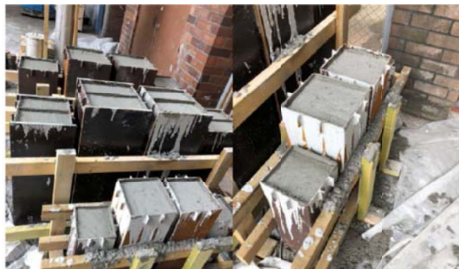
Fig. 4 High strength steel slenderness tests, (Huang et al, 2019)

High strength steels have been used in practice for over two to three decades with fabricated quenched and tempered structural steels being used particularly in iconic structures. Recent research has been carried out to further optimise high strength steel sections for use in composite sections, (Huang et al., 2019) as illustrated in Figure 4.