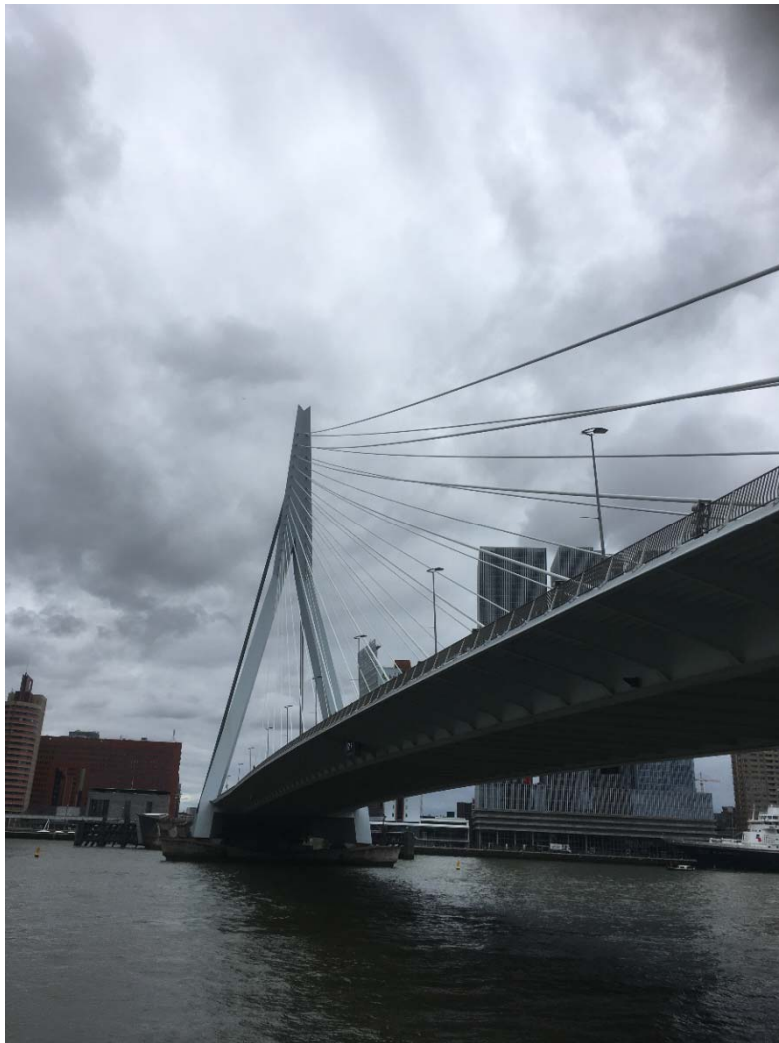
Fig. 2 Erasmusbrug, Rotterdam, Netherlands

There are many key challenges facing the civil engineering and construction industry. The most obvious challenge in modern society is the increased urbanization of the world's population. This explosion in growth in cities and megacities around the world has put a strain on higher density living and office environments. Thus, the ability to build taller buildings is not only a challenge but an increasing necessity. The international trend in tall building construction is to use composite, steel or mixed systems which is now prevalent in 70% of 100 of the world's tallest buildings, (Council on Tall Buildings and Urban Habitat, 2018). Furthermore, many of the world's longest bridges employ the use of steel or composite techniques. The key challenges in buildings and bridges are to achieve higher performance structures, with higher strength to weight ratios coupled with optimal durability.