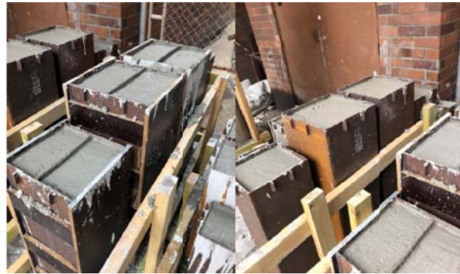
Fig. 5 Ultra high strength steel slenderness tests, (Li et al, 2019)

Ultra high strength steels have been in existence for many years and have often been used in defence and mining applications. Furthermore, developments in the automotive industry can produce steels up to 1500 MPa. Ultra high strength steels of ultimate yield strength of 1000 MPa using fabricated techniques can now be produced for civil and structural engineering applications. Recent research has been carried out to optimise ultra high strength steel sections for use in composite sections, (Li et al., 2019).