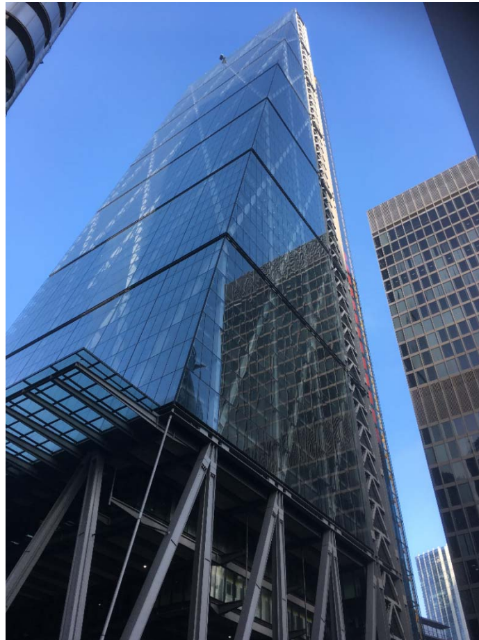
Fig. 3 Leadenhall building, London, United Kingdom

DfM has been of significant interest in the building and civil engineering sector for a number of decades. DfM allows builders and contractors to manufacture building components off site and can reduce workforce on site. This has significant benefits in terms of labour cost and safety. An iconic steel and composite structure, Leadenhall building in London used significant amounts of DfM techniques with the use of prefabricated structural steel and precast concrete as illustrated in Figure 3.