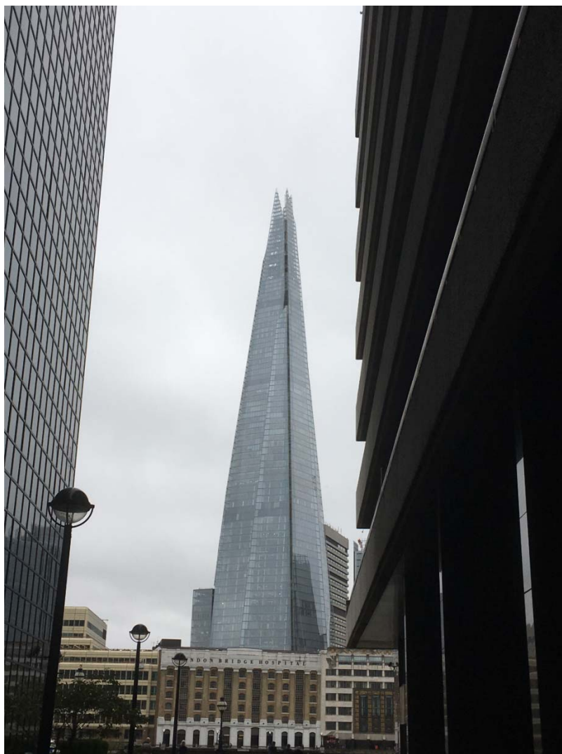
Fig. 1 The Shard, London, United Kingdom

concrete to compressive strengths of up to 200 MPa for modern reactive powder concretes. The benefits of composite structures have always been founded in the juxtaposition of concrete with steel to allow both materials to be used in their optimum mode. Steel has high tensile strength and when used in compression in thin sections can have its local and overall stability improved by the juxtaposition of concrete to arrest the local and global instabilities. Concrete is best utilised in compression and can be significantly improved by the use of reinforcing steel, prestressed or post-tensioning steel or by the use of steel to confine concrete in a core to achieve its optimal compressive strength. A modern day iconic example of the use of steel and composite construction is evident in the construction of The Shard, London, see in Figure 1.